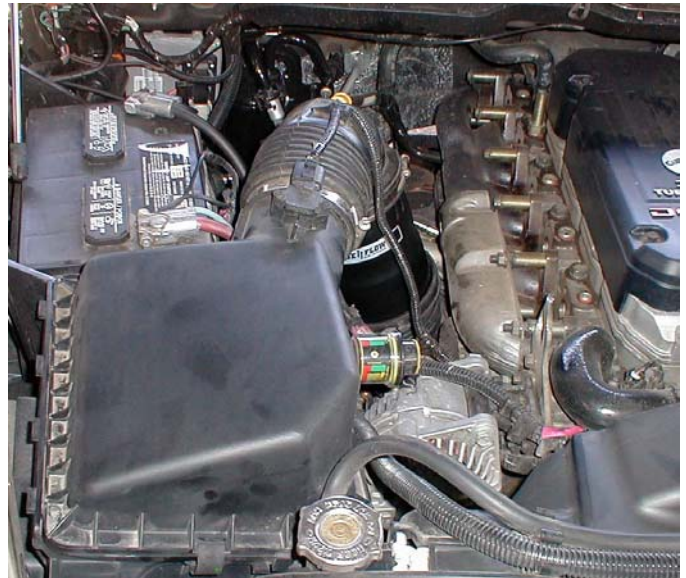
True Flow installed